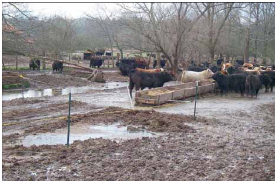
Figure 1. Improper grazing use and lack of nutrient management next to a stream.

Cattle grazing patterns are controlled largely by the surrounding environment, with topography, water accessibility, forage quality, salt or mineral location, and shade being key factors. Other contributing factors may include pasture shape,